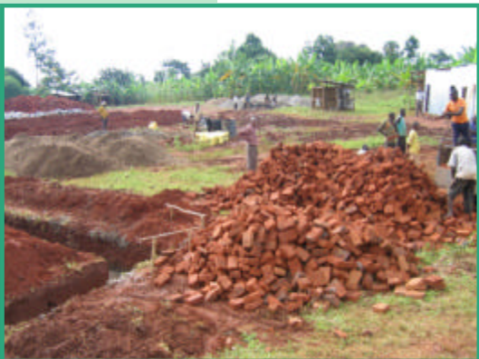
Construction of New Classroom Block

APPRECIATION FDNC is grateful to the American Jewish World Service (AJWS) and Church World Service (CWS) for the funding that enables the creation, printing, and distribution of these quarterly newsletters.