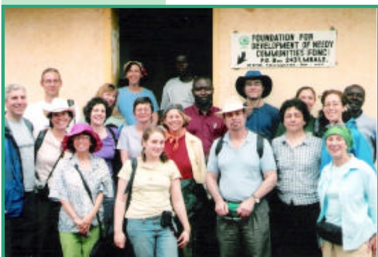
AJWS Delegation from Chicago (April '05)